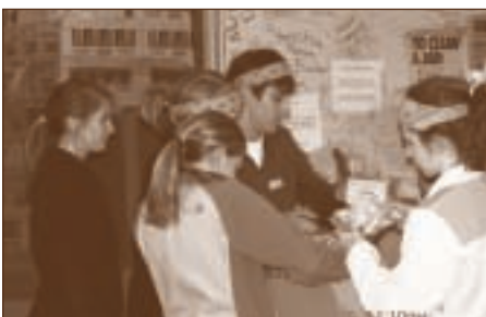
Grace kids sorting box