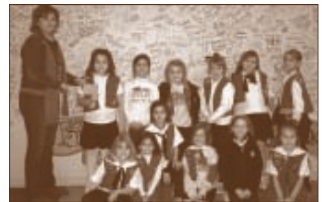
Brownie Troop 1202