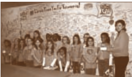
Girl Scout Troop 1066